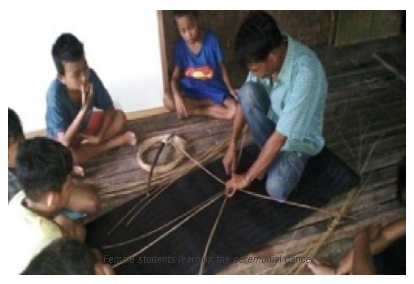
Students learn how to make the roiget basket