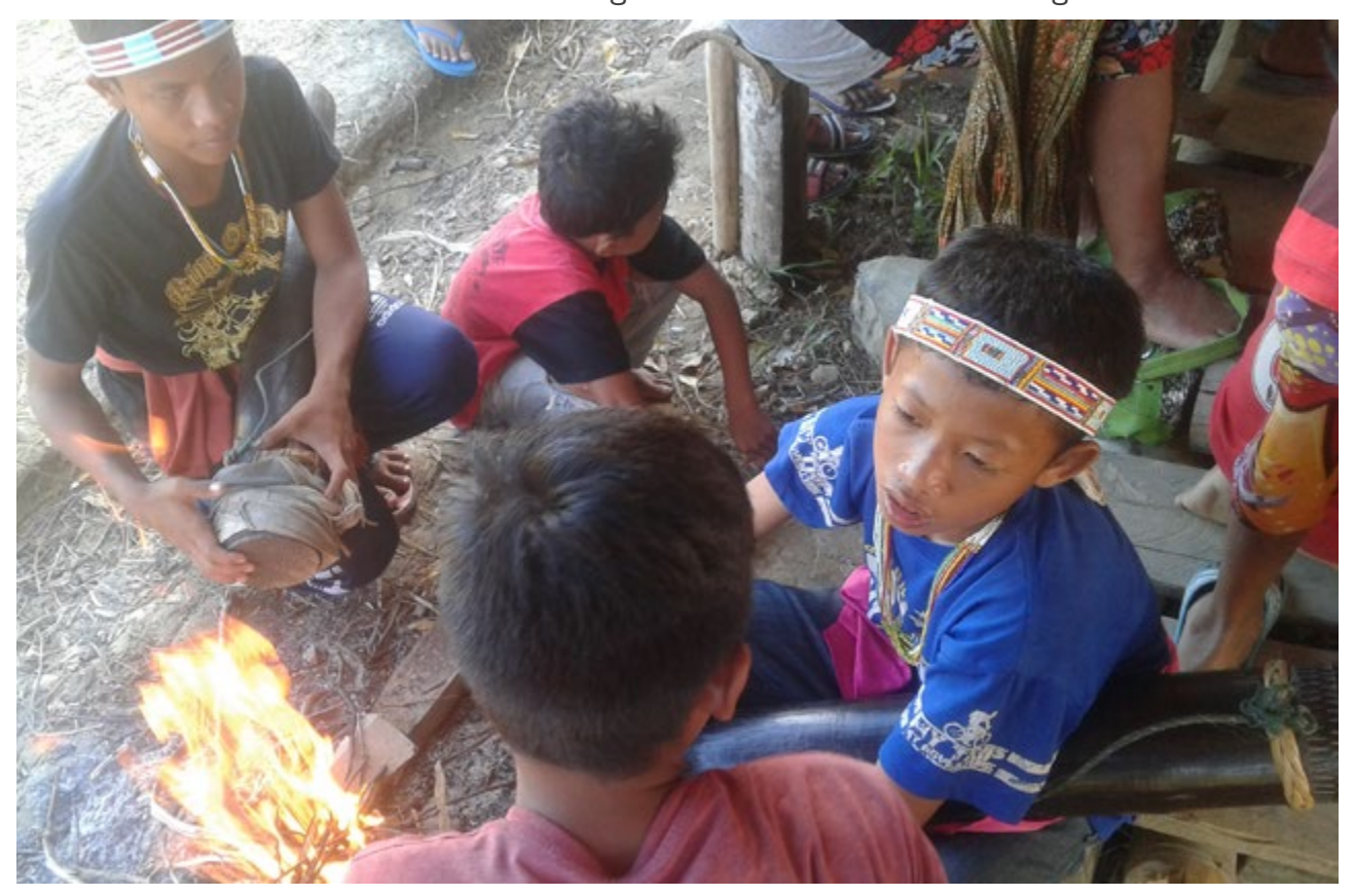
The YPSM program students are learning the art of ceremonial dance and muic - this dance is the story of the Eagle. As they are leaning about Mentawai culture, the students find that they already understand the basic motions involved.

Prior to commencing practice of the ceremonial dances, the gajeuma (drums) must first be heated. This is done so that the skin is tight and the sound is loud and good.