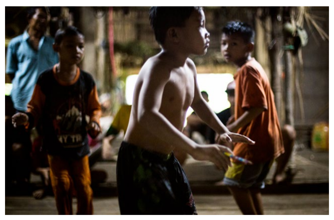
Students learn ceremonial dance and singing