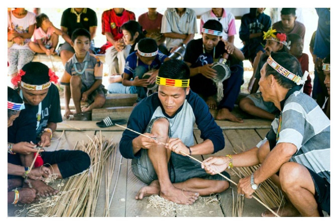
YPSM students are taught how to weave traditional baskets