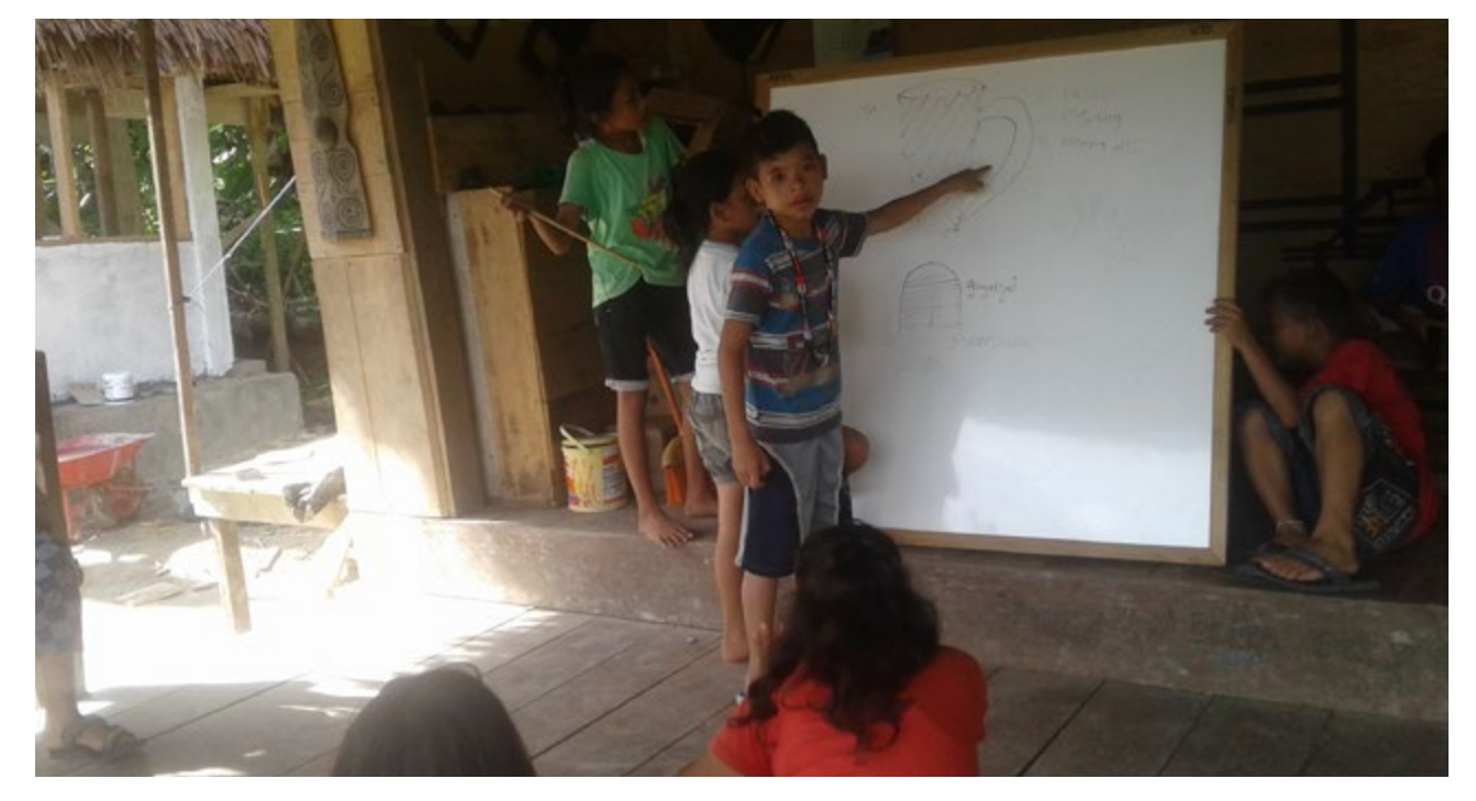
YPSM students discussing the various arts and crafts

The implementation of cultural education, including culture and art activities mentioned above, is provided along with our own teaching methods to students ranging of all ages so that they can gain knowledge about the culture of mentawai and help top reserve and develop it amongst this generation.