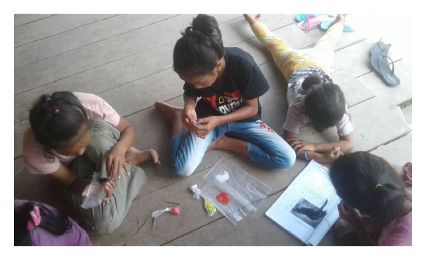
The students also have fun practicing to make the ngalou necklaces as it is traditionally a very social activity for women.

In addition to making roigets (baskets), women also practice the art of making ngalou (beaded necklaces). The girls are very motivated to practice this skill so that students can know how to make the ngalou plus much much more.