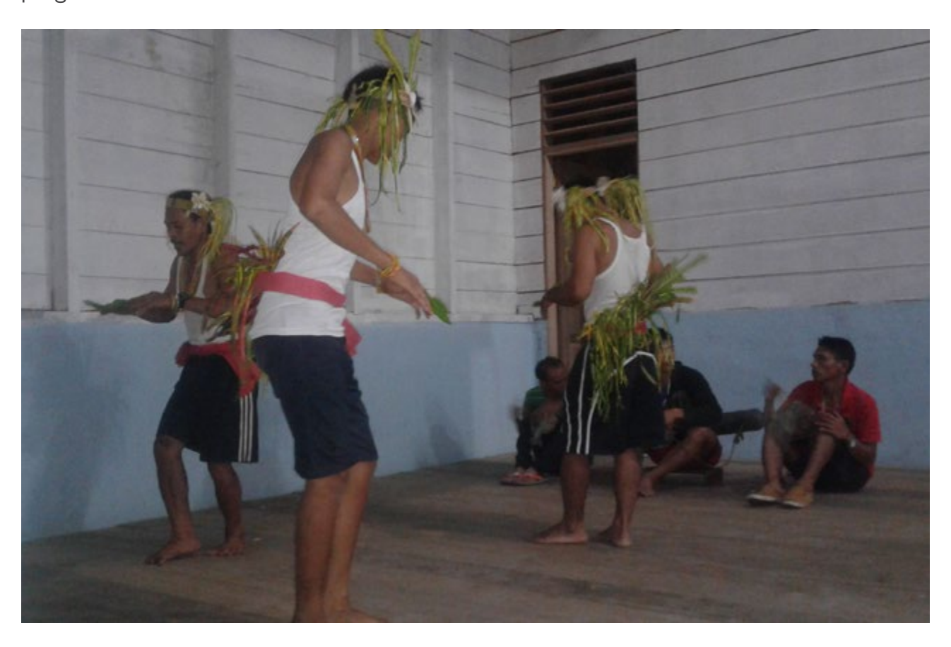
The Saliguma community watch on and are very interested in learning the art of Mentawai cultural dance. They are enthusiastic because through YPSM and our program they can revive their connection to culture.

Photographs of cultural dance demonstration at Saliguma village, performed by members of the cultural studio in Saibi Samukop. This is to show the art of dance and help explain our program activities.