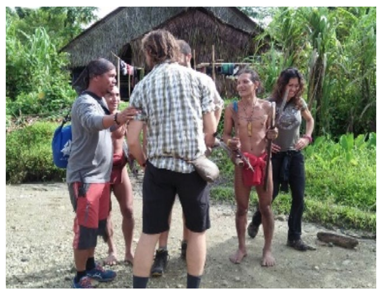
Ecotourism guests are discussing with local people before departing for the forest, so as to ensure they don't become injured or feel unsafe. For the sake of the safety of guests who travel, guides must provide directions to guests throughout the tour.