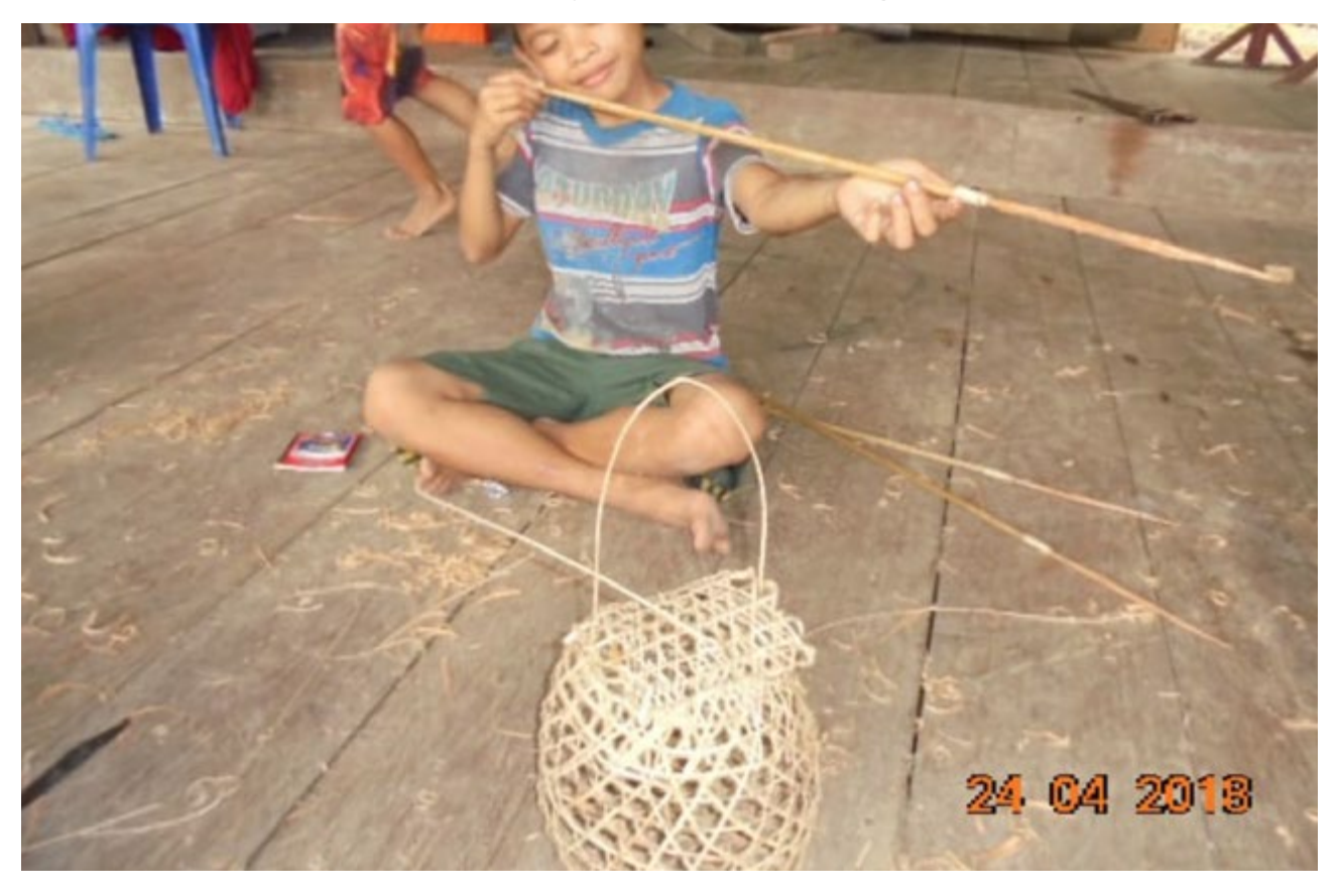
Whilst not all students have completed their roiget or yet know how to make them, some do and others are in the process of learning.