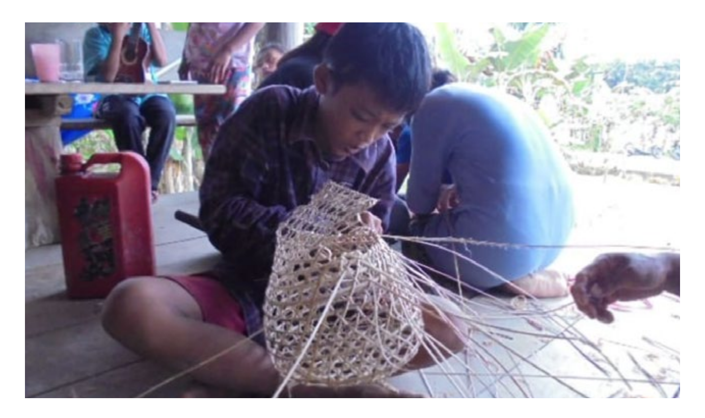
The results of the lessons taught by the studio teachers is that the students are nearing completion and are able to successfully weave their own roiget.