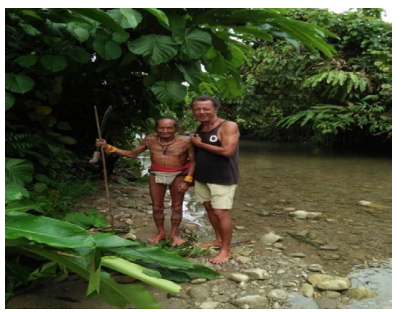
Mentawai Ecotourism guest is trekking in one of the tourist attraction, the Buttui district. Buttui is one of the most enjoyable trekking locations for tourists. Besides, local residents in Buttui are still practicing our traditional culture.

Mentawai Ecotourism is a business initiative we've developed to help protect our tribespeople, culture and forest habitat. One key aspect of this supprt is that 10% of all proceeds from guests goes to our YPSM culturla educaiton program. In addition, Mentawai Ecotourism is a proffesional system to ensure the experience and impact of guests is bringing benefit to the community - including caring for guests and advising them on how to help us keep our natural environment clean from rubbish and disease.