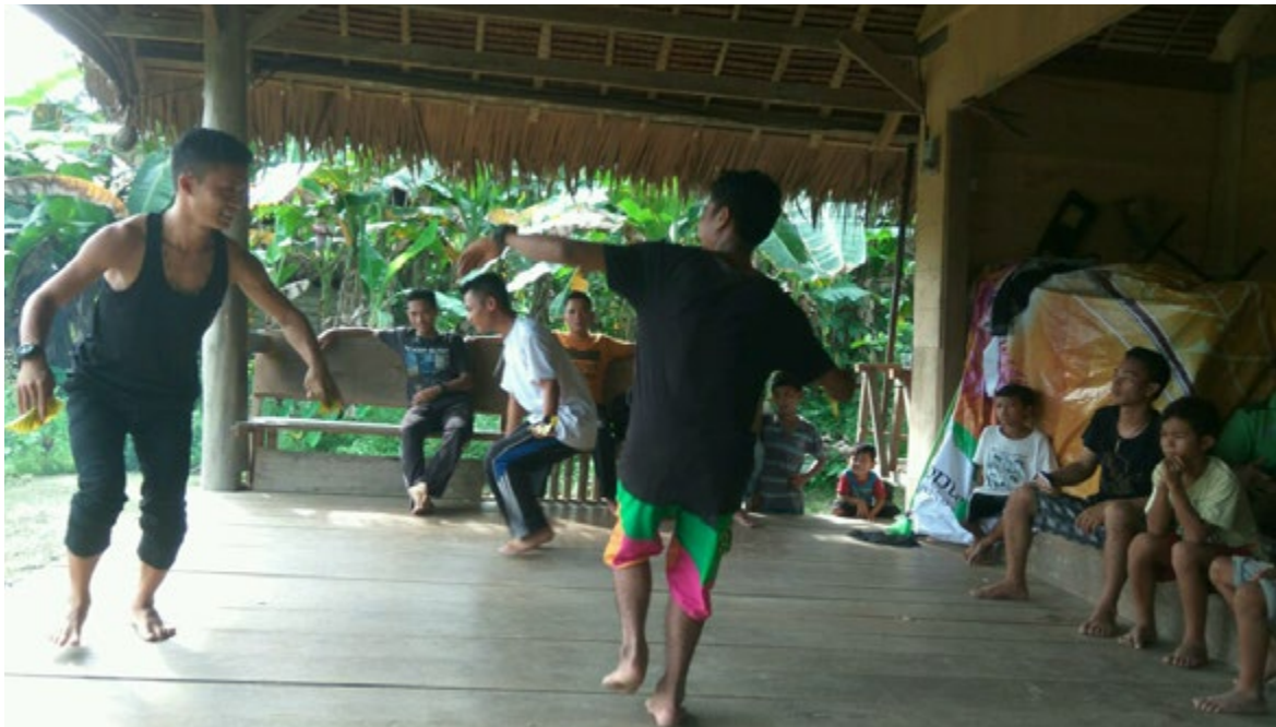
Teenage students training

The foundation committee conducts a review of the dance training for the Pesona festival contest. The students from the Jaraik sikerei studio will perform in the category of children and the category of teenage laggai. We shall bring 3 teams - 2 teams in the category of children and 1 team of teenage category. Training was conducted for one week at the uma jaraik sikerei studio.