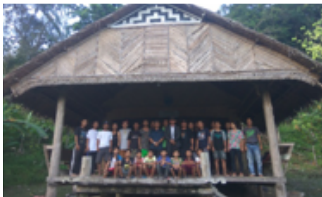
Photograph together with all studio organizers and students