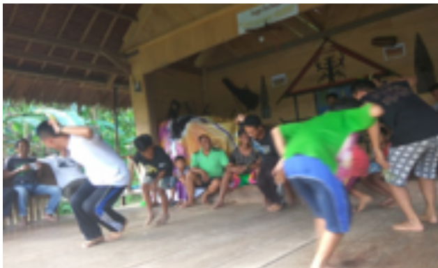
Participants who have been selected for the Festival begin practicing their performance