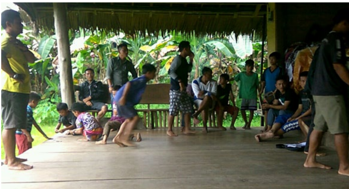
Children students training