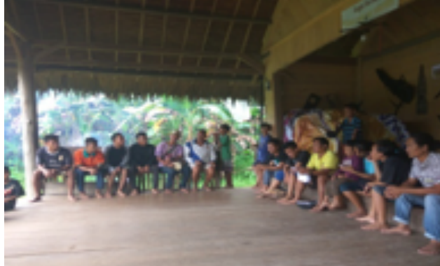
The children of the studio are listening as the foundation secretary explains