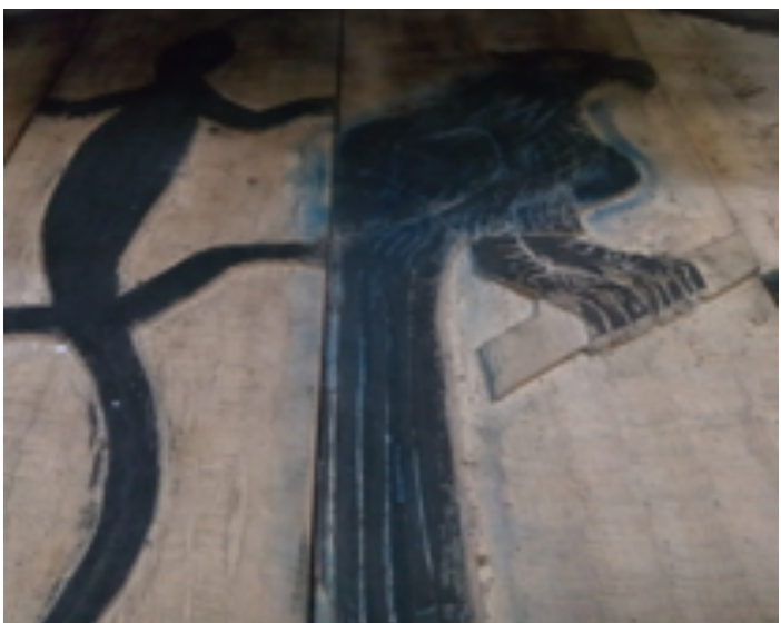
PAINTING OF CICAK AND HAWK