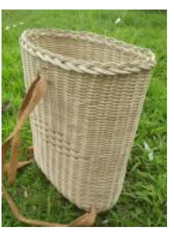
Montlhy expenditure to further this target: AUD $ 50

V. Strengthening indigenous hub learning materials for present and future generations During November, the Suku Mentawai team (YPBM) continued work on 3 existing projects: