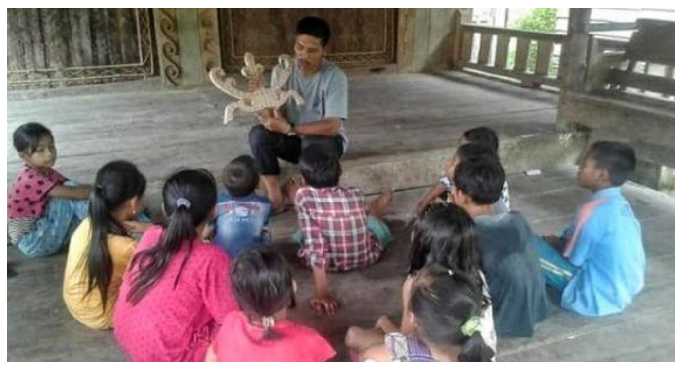
Funds spent this month to further our target: AUD $ 200

All learning hub students this month have shown increased awareness and understanding of Mentawai culture and its value for our future. This was highlighted by the two celebration events at Kulukubuk and Pasigeugeu hub. Beyond performing our traditional music and dance (turu' laggai) at a very high standard, both Pasigeugeu and Bubuakat Simalainge' students also showed that they can apply various types of plant medicines and handicraft arts. The bubuakat simalainge' students also performed creative dance and several traditional Mentawai songs at the joint event in welcoming Lady Glory and her team.