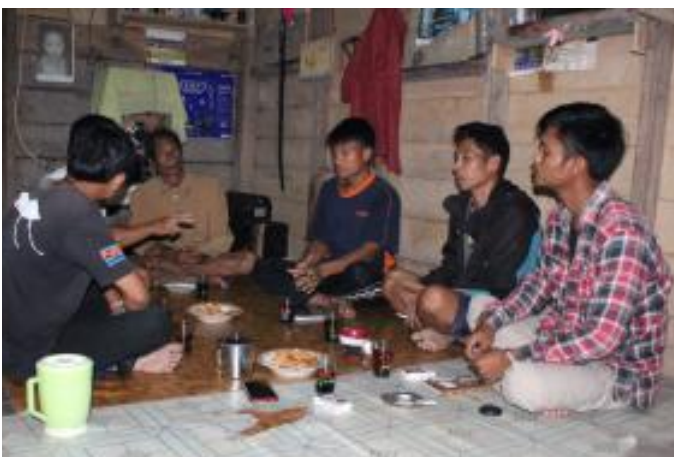
Funds spent this month to further our target: AUD $ 45