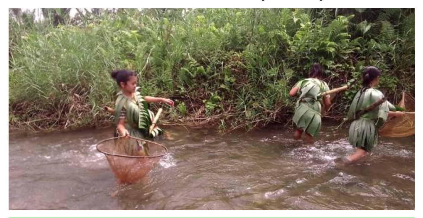
Funds spent this month to further our target: AUD $ 79

Learning hub students continue to strengthen their understanding of cultural knowledge and its value for the future. During December, the students across all hubs were taught about indigenous folklore, medicines, ceremony, ethnobotany, language and song and dance. In particular, the students were enthusiastic about the opportunity to perform their skills and talents as part of a big Christmas celebration event. We are seeing significant increase in the student's imaginative skills, confidence and mental capacity as a result of the learning hub program, which continues to instill these cultural values in our students from generation to generation.