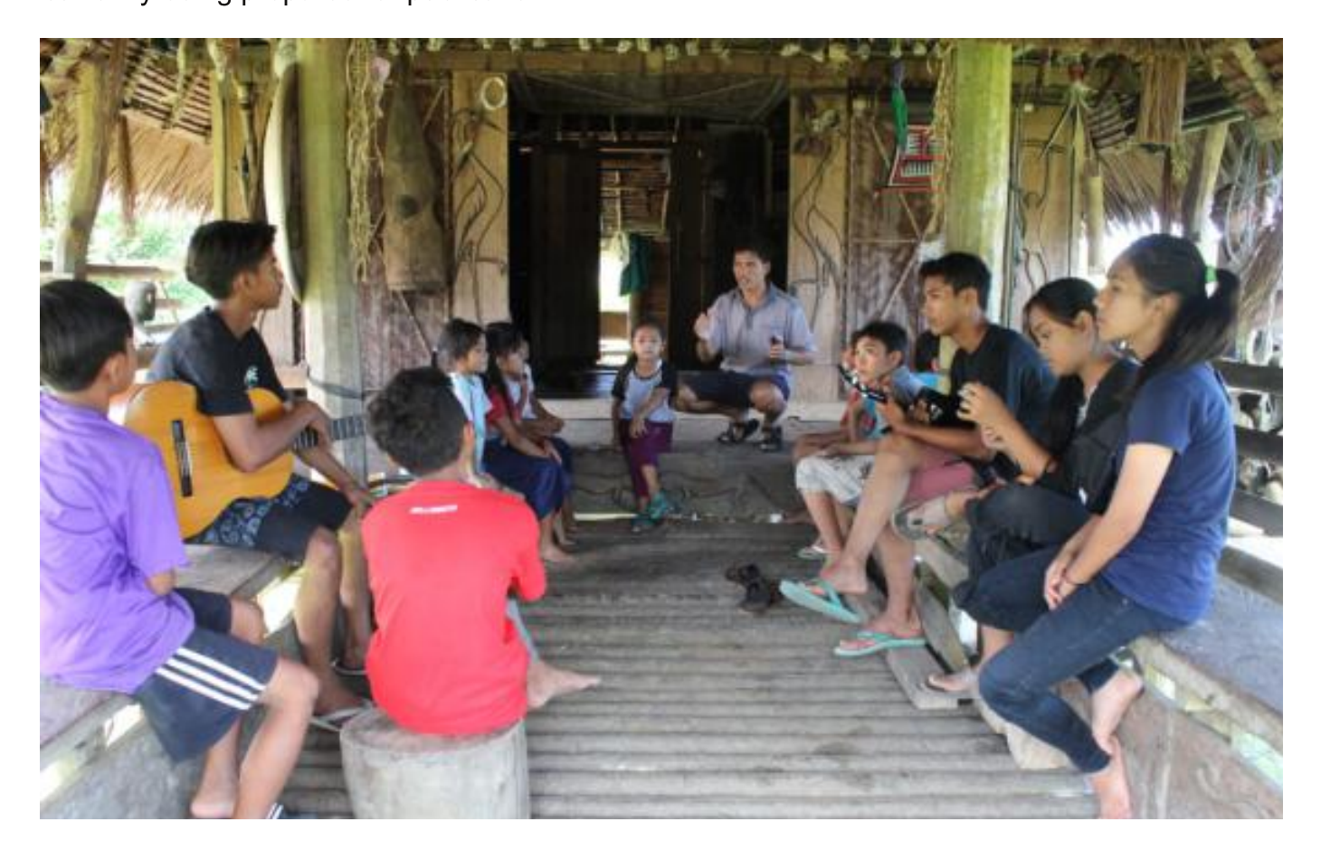
Funds spent this month to further our target: AUD $ 100

Our Mentawai Indigenous Learning Foundation (YPBM) team consists of 9 staff and 8 learning hub teachers. This month YPBM conducts an Annual general meeting with all senior directors and advisors, which gives us great opportunity to review our activities and progress throughout 2020, and to develop strategic plan for improvements in 2021. A detailed annual report is currently being prepared for publication.