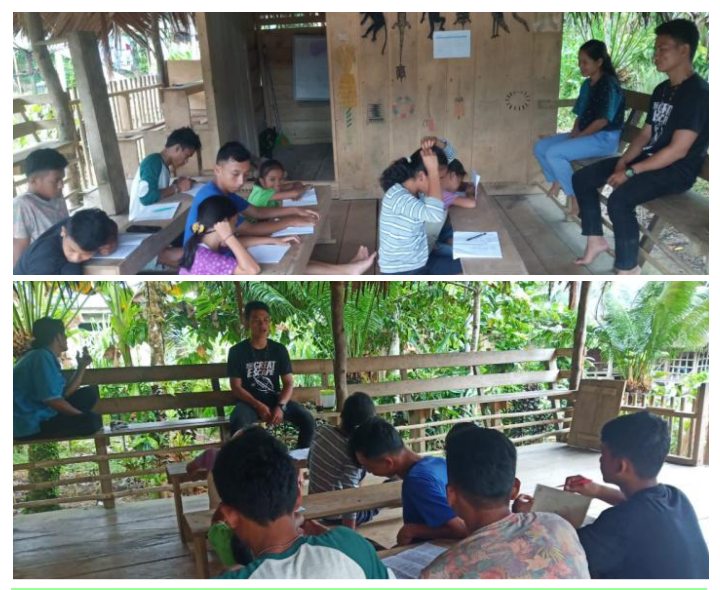
Funds spent this month to further our target: AUD $ 100

To overcome these problems the YPBM team always conducts discussions on these problems, some ideas to overcome these problems are conducting training for teachers of traditional schools assisted by YPBM, holding discussions with parents and students, conducting discussions with traditional school teachers which will be held. by assistants in each YPBM-assisted traditional school. In June, it is planned that a report card reception will be held at the Pasigeugeu traditional school with the aim of reviving students' interest in always being present when learning Mentawai Culture.