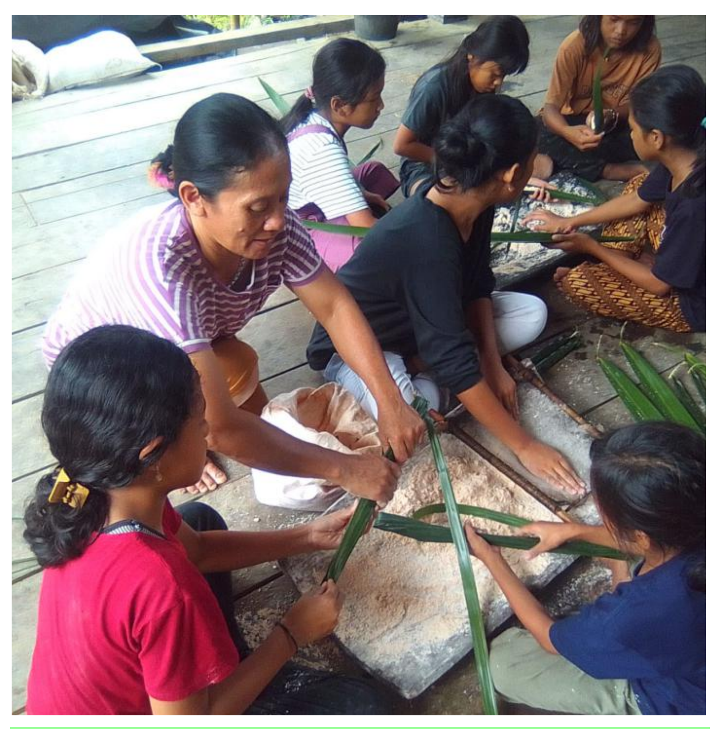
Funds spent this month to further our target: AUD $ 210

To carry out and strengthen the YPBM program development strategy in September-October the team provided assistance and evaluation as well as discussions with teachers of YPBM's assisted traditional schools regarding the traditional school development strategy. The YPBM team also always conducts evaluations or discussions regarding future activities and strategies that have been carried out or those that have not been carried out for the smooth running of the YPBM program.