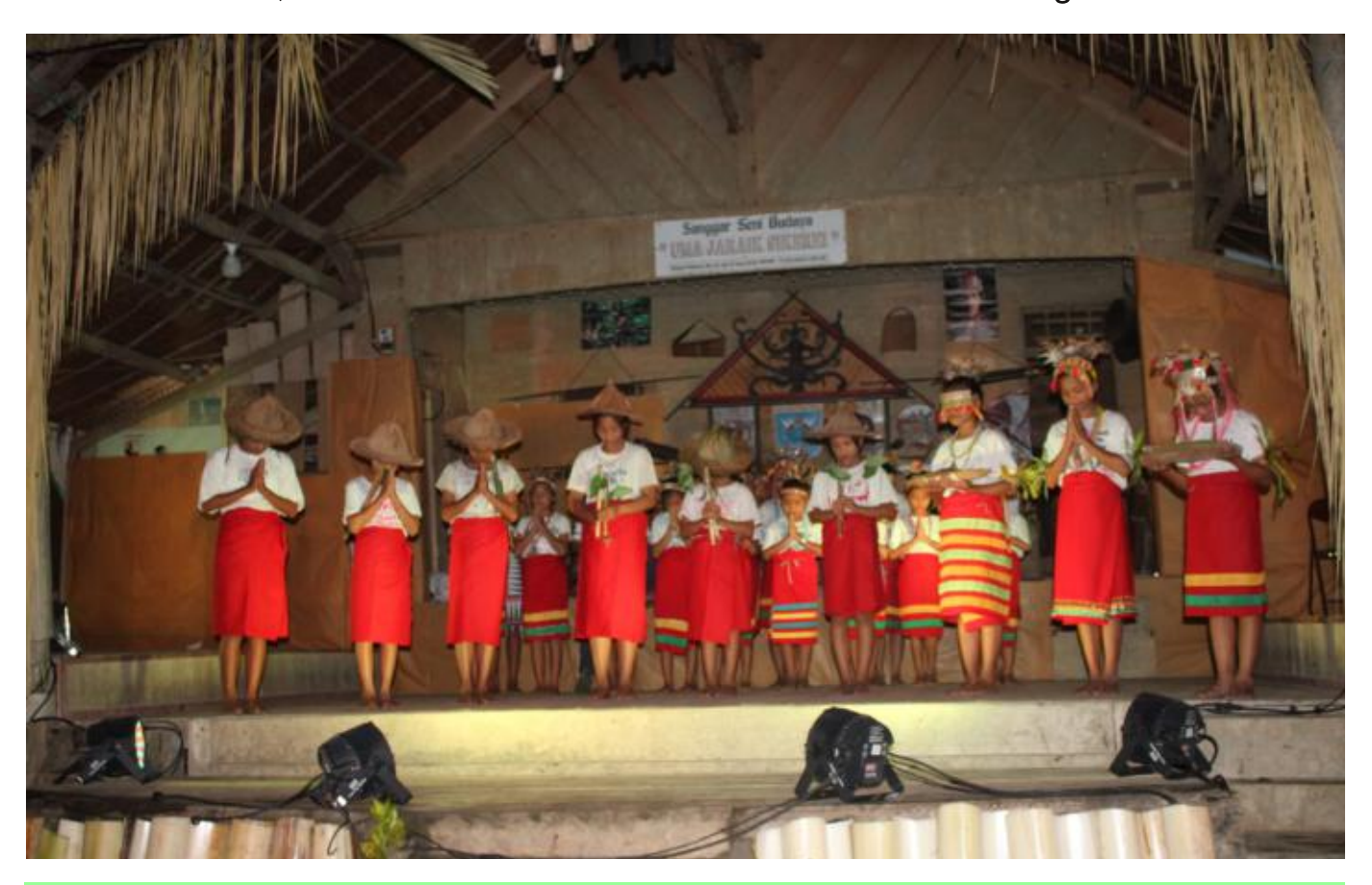
Funds spent this month to further our target: AUD $ 850

Currently YPBM assisted traditional schools already have 9 cultural schools. In the last two months, there are 277 students who are active in learning culture