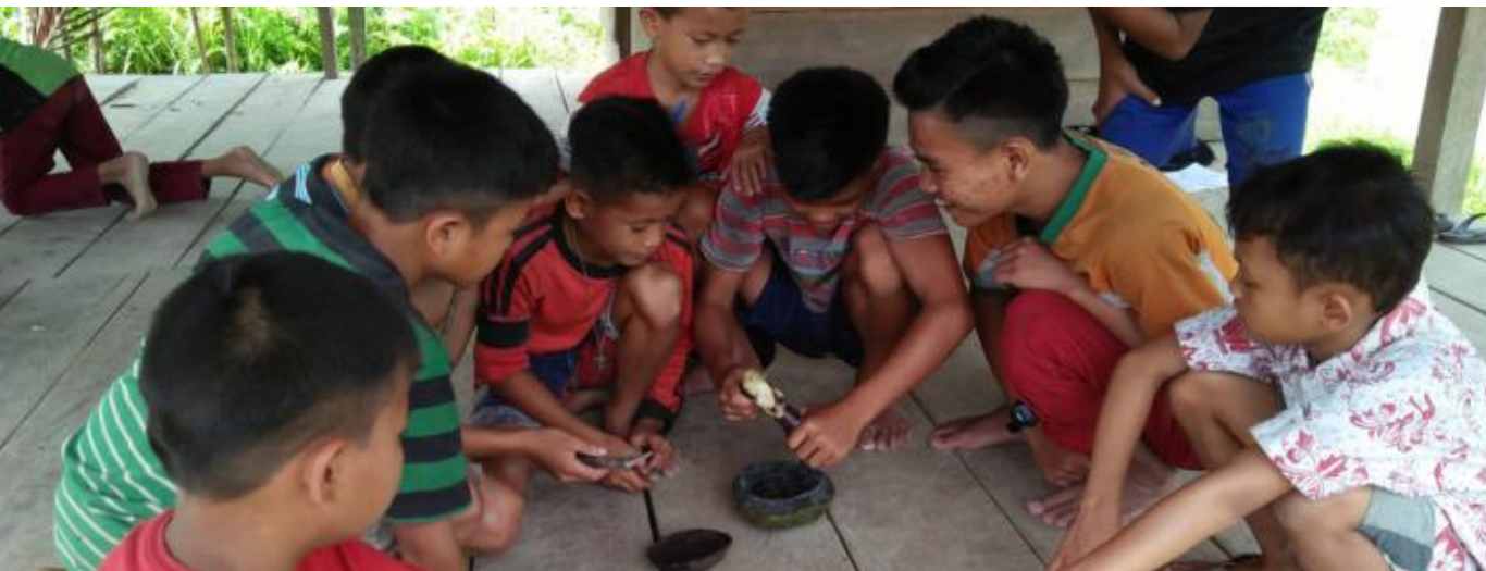
Funds spent this month to further our target: AUD $ 340