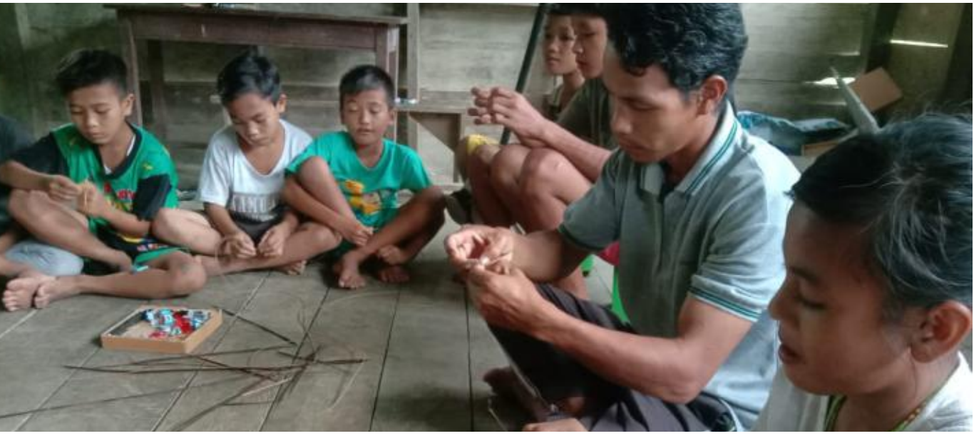
Funds spent this month to further our target: AUD $ 0